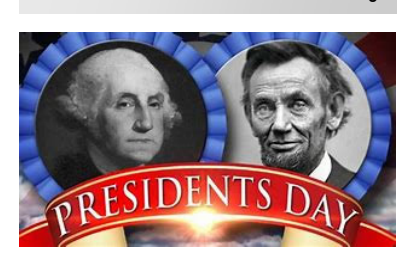
We will be Closed Monday, February 19, 2024